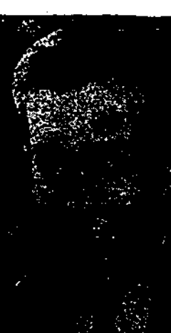
SEN. CLIFFORD CASE