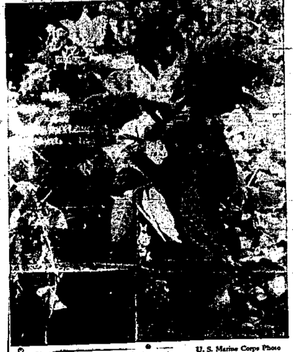
These Marine add finishing touches to their camouflage prior to participating in a scouting and landing practice on a mock island.