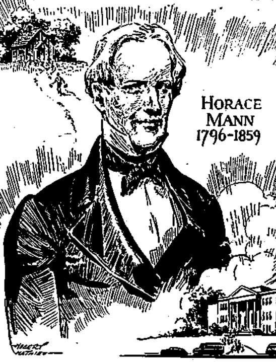
HORACE MANN 1796-1859

THESE WERE HORACE MANN'S WORDS WHEN HE LOCKED THE DOOR OF HIS PROFITABLE LAW PRACTICE TO DEVOTE HIS LIFE TO FOSTERING THE AMERICAN PUBLIC SCHOOL SYSTEM.