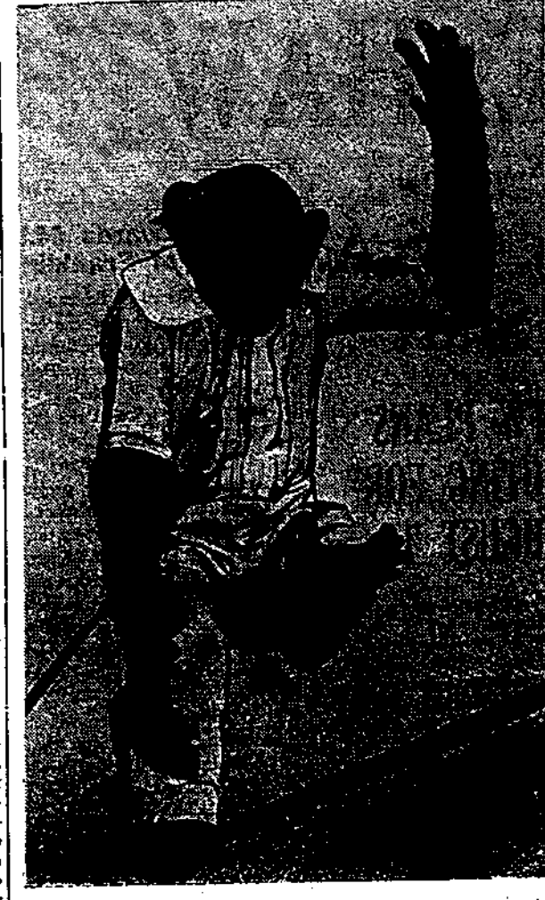
Irish Watkins' educated chimpanzees are appearing twice daily at the free outdoor stage show at Palisades Amusement Park. The group of highly trained simian performers of all sizes present a fast moving routine featuring several amazing stunts.